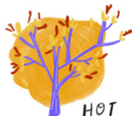
HOT CHEETO PLANT